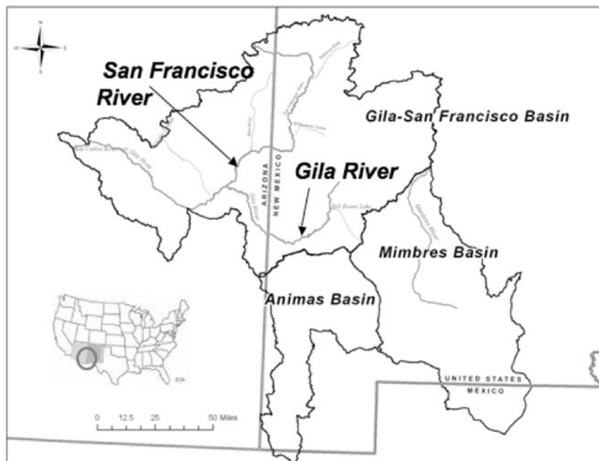
Figure 1. Map of the region featured in this case study.

Thirteen individuals (including two of the authors) from 10 institutions and organizations representing federal, state,